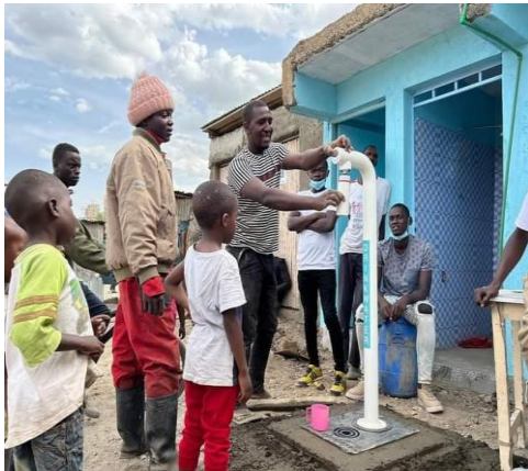
Water station at Madoya (Kenya)

Other successfully completed water kiosk projects for the period March 2020-March 2022 in Kenya included Peresten ACK Primary school, Kamaata SA primary school in Cheptasis Bungoma County and Madoya, in Matharee slums in Nairobi. The latest water kiosk is still in its initial stages of implementation at Karugia secondary school in Murang'a County, Kenya.