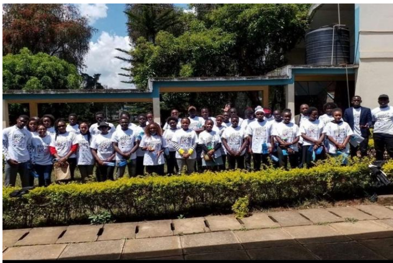
REC Exhibition at UON, Lower Kabete campus