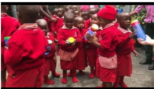
Water Bottle distribution in Kibera

Between October 2021- November 2021, ITF and JTP embarked on a water bottles distribution activity in Rwanda in 3 different districts (Muhanga, Rulindo, and Gasabo). It took place in 14 governmental schools and 10920 school children benefited.