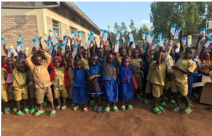
Muhanga District Water Bottle Distribution

3) Refillable Water Bottles -ITF gives environmentally friendly and refillable water bottles that are BPA-free plastic. The bottles are distinguished with a Dutch Design Award. Children are therefore able to carry a bottle with water from home to school, in schools with no water pipeline