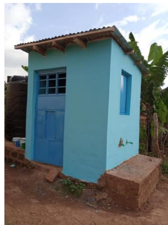
Foundation base for the water kiosk at Kamataa Primary School (left). An almost complete water kiosk at Peresten Primary School (right).