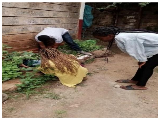
REC Participants Implementing Lab findings